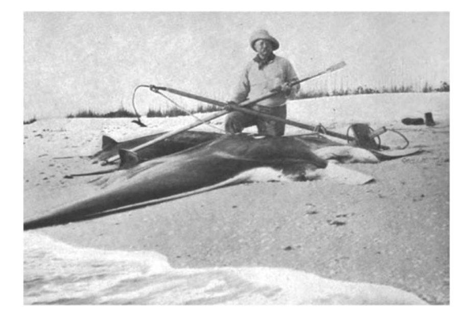
Figure 1. US President Theodore Roosevelt with Manta birostris harpooned recreationally off Florida in 1916 (Roosevelt, 1917).

Targeted mobulid harpoon fisheries have been documented across Indonesia including Lombok, Lamakera, Lamalera, and villages in the Alor region (Dewar, 2002; White et al. 2006a, A. Marshall, pers. obs.). Most have existed for