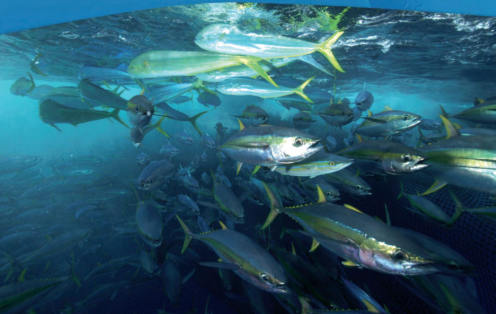
Yellowfin tuna, rainbow runner and mahi mahi in a purse seine net