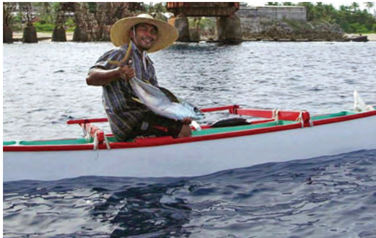
Artisanal fisherman displaying a yellowfin tuna caught at a nearshore FAD off Yaren, Nauru

Artisanal FADs are used to improve the catch rate of people who catch fish to feed their families or sell in small amounts at local markets, as well as people who fish as a hobby. They are anchored within range of small motor boats and canoes and they are an important tool for food security and domestic fisheries' development. The fishing methods used, such as handline and trolling, select only the species that the fishermen want, and only a small proportion of the fish around the FAD are caught.