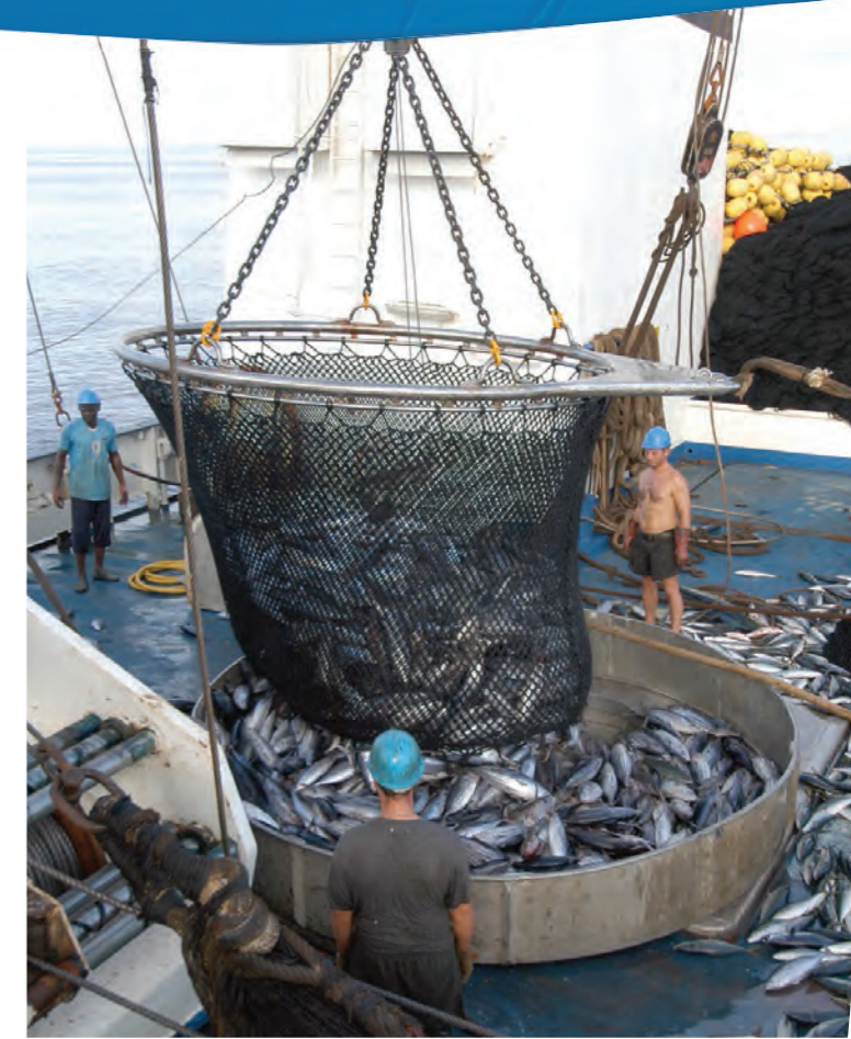
Purse seine catch