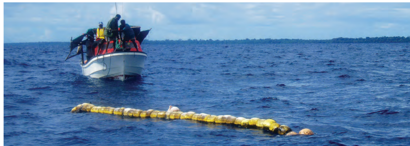
Artisanal offshore FAD off Kavieng, Papua New Guinea