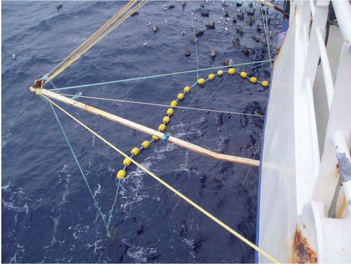
Figure 3: Type III – Two booms with purse seine buoys (with or without streamers).

ranged from 5 to 34, and their length varied between reaching the water's surface and half way toward the water. Observers reported that weighting the streamers with objects that would 'jib' about in the wind and water, such as stainless steel tubing or bottles, increased the effectiveness of the device. It was also noted that there were some problems with entanglement in the hookline/hauling gear in bad weather but that the heavier weighted streamers were less prone to becoming entangled.