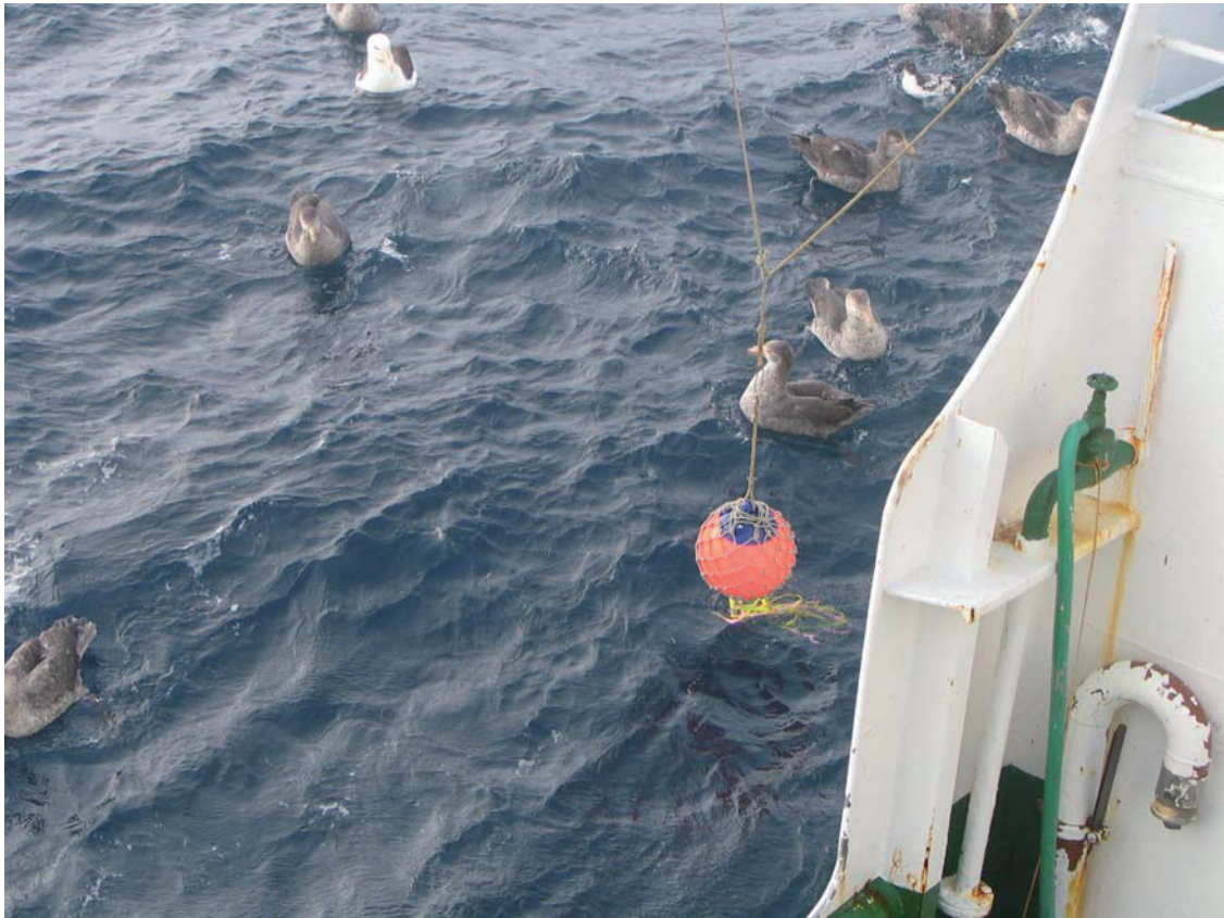
Figure 1: Type I BED – Single boom with single or multiple suspended objects.