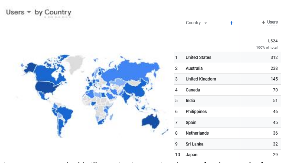
Figure 4 – Map and table illustrating international usage for the month of June 2023, with the top 10 (of 103) 'countries of origin' listed.

The BMIS has a global audience, as shown in Figure 4, below. Whereas predefined regional reports, e.g., summary statistics for the Pacific, were available under Google UA, as yet these aren't available via GA4.