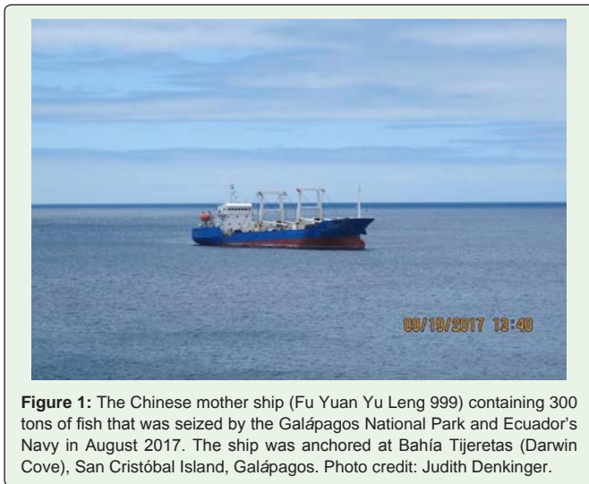
Figure 1: The Chinese mother ship (Fu Yuan Yu Leng 999) containing 300 tons of fish that was seized by the Galápagos National Park and Ecuador's Navy in August 2017. The ship was anchored at Bahía Tijeretas (Darwin Cove), San Cristóbal Island, Galápagos.

On 13 August, 2017, a Chinese factory-mother ship (Fu Yuan Yu Leng 999) (Figure 1) navigating within the GMR (i.e. at about 0°38'37"S-89°03'09"W) was caught carrying ≈ 300 tons of fish; and subsequently, the vessel and the illegal fish catch were confiscated by Ecuador's Armada and the Galápagos National Park [6,9-11]. The illegal marine catch was composed by tuna fish ( Thunnus spp.), species which are currently undergoing a regional large-scale seasonal closure in the Southeastern Pacific, as per recommended by the Inter-American Tropical Tuna Commission (IATCC), of which Ecuador and China are both signatory countries ( https://www.iattc.org/HomeENG.htm ). The illegal catch also included 6000 finned sharks that fall within categories of threatened species under the International Union for Conservation of Nature (IUCN) status, as the Vulnerable (VU) pelagic thresher shark ( Alopias pelagicus , [12]), the Near Threatened (NT) silky shark ( Carcharhinus falciformis , [13]); and, of particular concern, the Endangered (EN) scalloped hammerhead sharks ( Sphyrna lewini , [14]); [6,9,11], as shown in (Figure 2). From the total number of sharks (i.e. 6000 individuals) harvested by this fleet, and assuming that both the first grade fins (i.e. the first dorsal fin, pair of pectoral fins and lower lobe of the tail, as