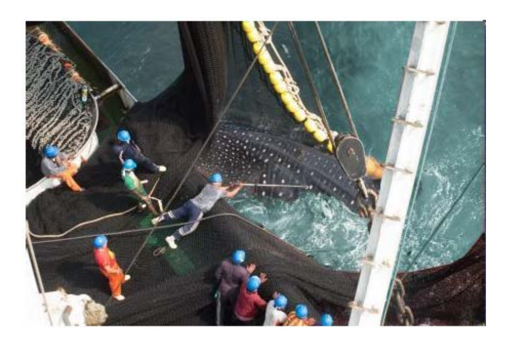
Figure 4. Tagging of a whale shark by Murua et al. (2014)