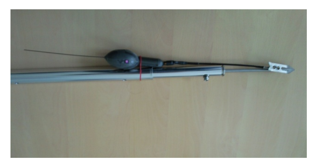
Figure 1. Configuration of tag ready for deployment in the Escalle et al. (2014) study showing 4-meter tagging pole, applicator pin, titanium anchor, 20 cm tag tether, and miniPAT tag with rubber band.