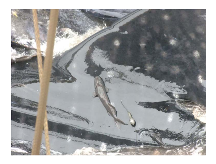
Figure 3. Tag as attached by Escalle et al. (2014)