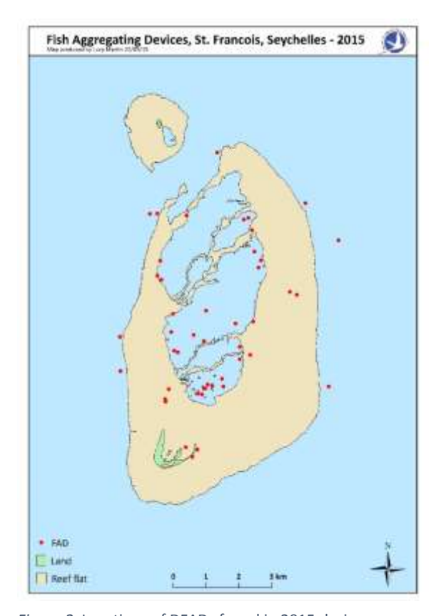
Figure 2. Locations of DFADs found in 2015 during a systematic survey of St. Francois atoll, Seychelles.

In 2015 data collection methodologies were reviewed and a database of all DFAD beaching events was created. Data collection parameters were chosen in order to determine which fishing vessel/fleet the DFAD came from and the environmental impact caused (Table 1). In April 2015 ICS teams conducted DFAD surveys around St. Francois and Farquhar atolls to determine the number of DFADs currently beached at these locations (Figure 2). A total of 96 DFADs were found during these