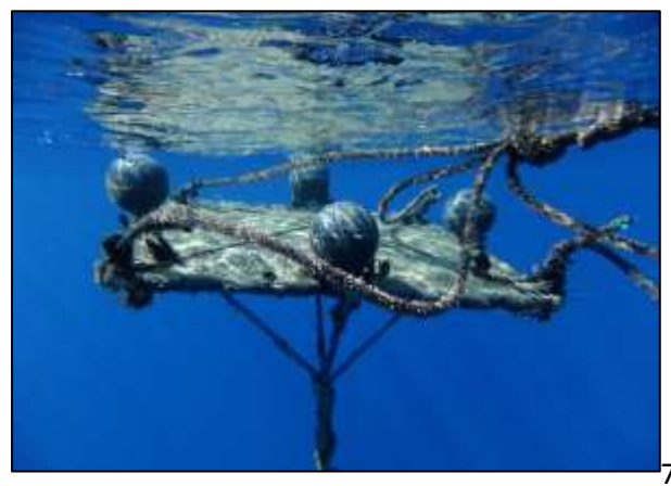
Figure 5. A DFAD consrtucted without netting

In terms of DFAD construction there was a relatively low proportion (18.4%) of DFADs that had hanging curtain nets as the aggregator. The use of fishing nets rolled up into a sausage (sausage net) was found to be the most common form of aggregator (62.1%). What was apparent was a lack of bio-degradable materials used in DFAD construction. In all the DFADs observed the aggregator components were made entirley of synthetic materials. Of DFADs using curtain nets that could be identified to a vessel 100% were from Spanish companies. Where the aggregator was recorded for