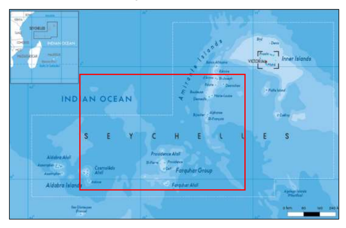
Figure 1. Study site (red box), the Outer islands where DFADs have been recorded.

The meteorology of Seychelles is dominated by two monsoon seasons which are named after the direction of the prevailing winds: the Northwest (NW) monsoon and the Southeast (SE) monsoon. The NW monsoon occurs during the austral summer from November to April and is characterised by light winds (<10knots). The SE monsoon occurs during the austral winter from May to October and is characterised by strong winds (>20knots). It has been observed that a greater amount of marine debris accumulates on the islands during the SE monsoon (Duhec, et al., 2015).