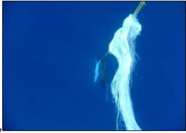
Figure 6. Synthetic rope with salt bags attached