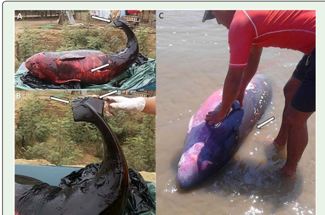
Figure 3: Specimens of dwarf sperm whales ( Kogia sima ) showing mutilation of fins. A-B) dwarf sperm whale exhibiting lack of caudal fin, which was systematically cut in two portions and removed (white arrows) and marks of entanglements by gillnets on the body (white arrow); this individual was found in the Puerto Lopez (Manabí Province) in July 2014; and, C) juvenile male of dwarf sperm whale missing the dorsal fin found in Crucita (Manabí Province) in August 2015.

and wounds inflicted by a predator were not found in any of the dead specimens.