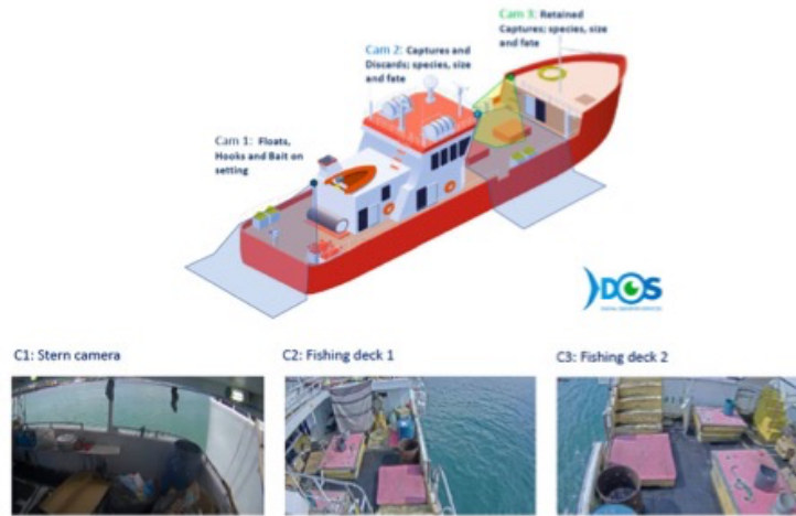
Figure 2 - 3-camera EM equipment installed on a longline covering main areas of fishing and fish handling operations. View of the 3 cameras: (left panel) Stern camera - setting longline providing information on hooks, floats, mitigation techniques and bait; (middle panel) Fishing deck 1 - hauling information, captures and discards, species ID, size and fate; and (right panel) Fishing deck 2 - fate of the species, size, species ID.

The vessel should prove that the EM system has been customized to the vessel to collect the required data on fishing activities, as described above (and summarized in Tables 2 and 3).