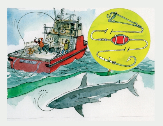
Fishermen can be injured by weights when the line suddenly breaks. Inset shows the Sliding Leads, a new weighting system developed to reduce the risk of injury.