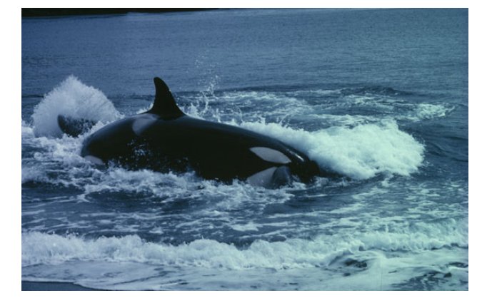
Figure 1. A killer whale works its way back into deeper water after taking an elephant seal pup at the water's edge; this kind of 'intentional stranding' can be dangerous for the prey and predator alike. Baie Américaine, Possession Island, Crozet Archipelago.