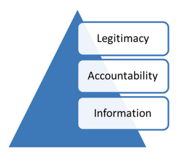
Fig. 1. The micro-, meso- and meta-functions of transparency in international regimes.

One way to understand the functions performed by transparency in international regimes is to draw a distinction between transparency's immediate and instrumental value and its broader impacts on the performance and legitimacy of regimes. Another way of putting this is to identify the functions of transparency at micro-, meso- and meta- levels. The primary and most obvious micro-function of transparency is to reveal the informational context in which an international regime operates. This then has multiple flow-on effects at the meso-level such as enabling the assessment of compliance with legal obligations and generally improving regime accountability. There are then further potential higher-order or meta-functions, including on regime legitimacy and even in some circumstances recalibrating power relations between States and non-State actors (see Fig. 1, below).