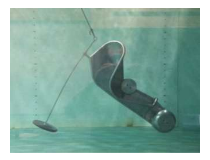
Figure 1: Kellian Line Setter Prototype 2 in the flume tank.

environment of a flume tank but further testing and evaluation at sea was required under normal fishing conditions.