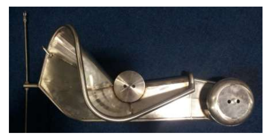
Figure 2: Kellian Line Setter Prototype 2.

In December 2013 Latitude 42 Environmental Consultants was awarded Contract 4529 to conduct seat trials of the Kellian Line Setter 2. The overall objective of this project is to test the at-sea feasibility, and to the extent possible, the effectiveness, of reducing the availability of hooks to seabirds by using the improved Kellian line setter, in inshore bottom longline fisheries.