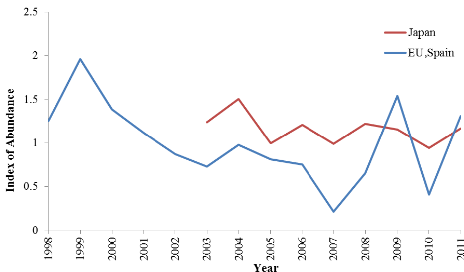
Fig. 2. Oceanic whitetip shark: Comparison of the oceanic whitetip shark standardised CPUE series for the longline fleets of Japan and EU,Spain.