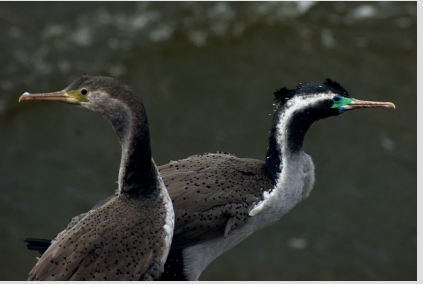
Juvenile and adult spotted shags, showing how they got their name.