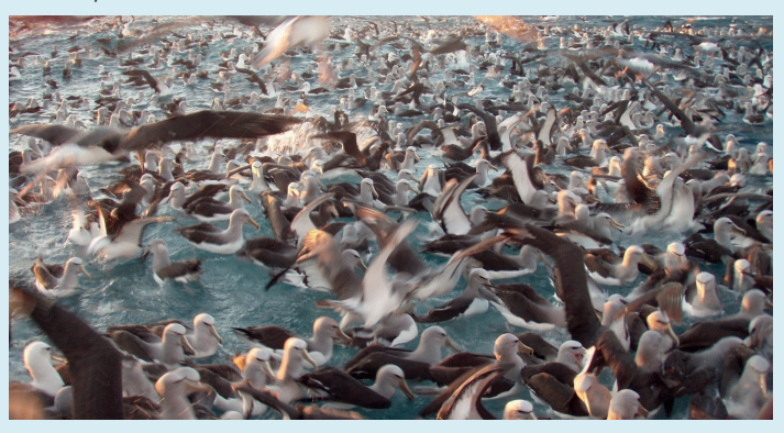
A good test for the SeaBird Saver: birds gathered astern a trawler at hauling.

short-term. In addition, monitoring efficacy over time is important, to ensure birds are not getting used to the device. The SeaBird Saver will be available as both a fixed unit, suited to larger vessels, and a handheld unit better suited for use on smaller vessels.