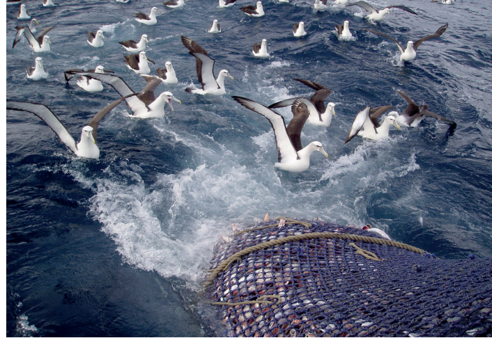
Seabirds, gear and the target catch ... three aspects of fishing of interest to government observers.

To find out more about information collected by observers, check the links in 'Want to know more?'