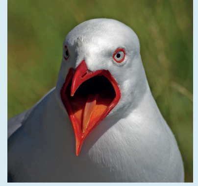
A red-billed gull shares its views.

The survey is now closed. However, if you still want to tell us your thoughts on the newsletter, send an email anytime (jpecnz@gmail.com).