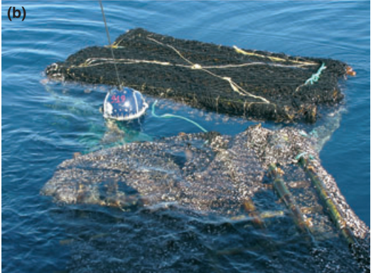
Figure 1 A tuna purse seiner (a) and typical drifting fish aggregating devices (b).

but only exploited by purse seiners in the western Pacific Ocean. Purse seining on free-swimming schools or schools associated with floating objects involves similar techniques (see Ben-Yami 1994 and Hall 1998 for details), and the main difference being that object-associated schools are usually less mobile and therefore easier to set on (which explains the higher catch rates on this type of sets, Fonteneau et al. 2000; Suzuki et al. 2003; Miyake et al. 2010). When setting on a drifting FAD, the purse seiner encircles the tuna school and the floating object and then, the floating object is carefully towed out of the circle. When setting on anchored FADs, the school is lured a short distance away from the FAD at night by using lights on the fishing vessel.