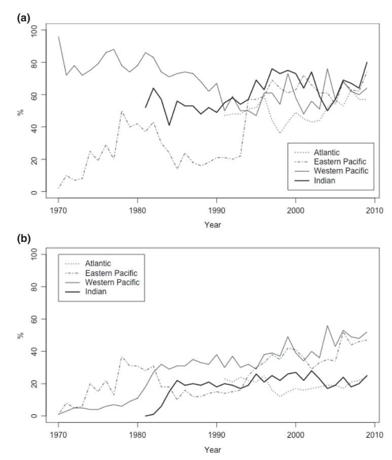
Figure 3 (a) Annual trends in the percentage of the catch of bigeye, yellowfin and skipjack tunas that is made on floating objects fish aggregating devices (FADs and natural logs), by Ocean Region, relative to total catches made by purse seiners. (b) Annual trends in the percentage of the catch of bigeye, yellowfin and skipjack tunas that is made on floating objects (FADs and natural logs), by Ocean Region, relative to all fishing gears. The global trend has been extrapolated without Atlantic Ocean data for 1970–1990 and without Indian Ocean data for 1970–1980. Data are from the Tuna RFMOs, publically available from the respective websites of each Tuna RFMO.

40% of the catch of tropical tunas comes from purse seine sets on floating objects.