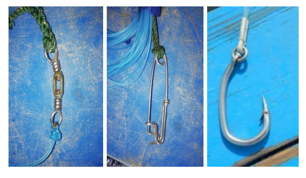
Fig. 4. Swivel, snap-on-clip and hook used for experimental longline

Yellowfin tunas caught through experimental longlining (Fig. 5-6) were transported to Karachi in chilled form. Loins were prepared from tuna and vacuum packed (Fig. 7-8)