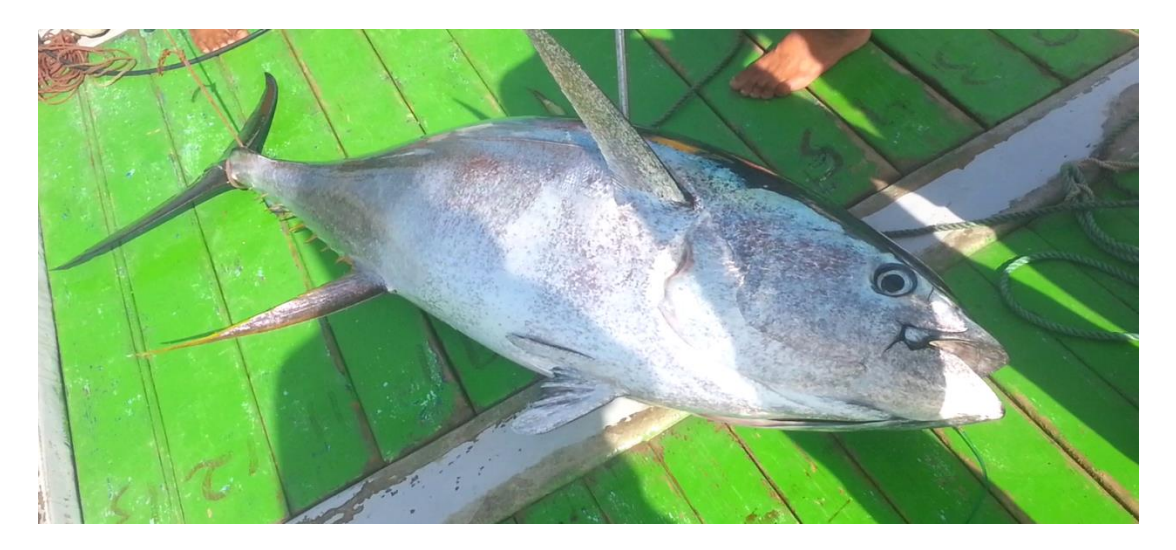
Fig. 5. Longline caught yellowfin tuna landed in the fishing boat.

and exported by air to some companies dealing with tuna loins in Dubai (UAE) and USA who have offered attractive prices between US $ 6 to 10 per kg. This price structure will make the fishing operation viable and successful. Following the steps of experimental longlining, a few boats (15 according to available information) conducted longlining, however, sold their product in local market. These experiments could not be continued after mid May because of rough seas due to southwest monsoon.