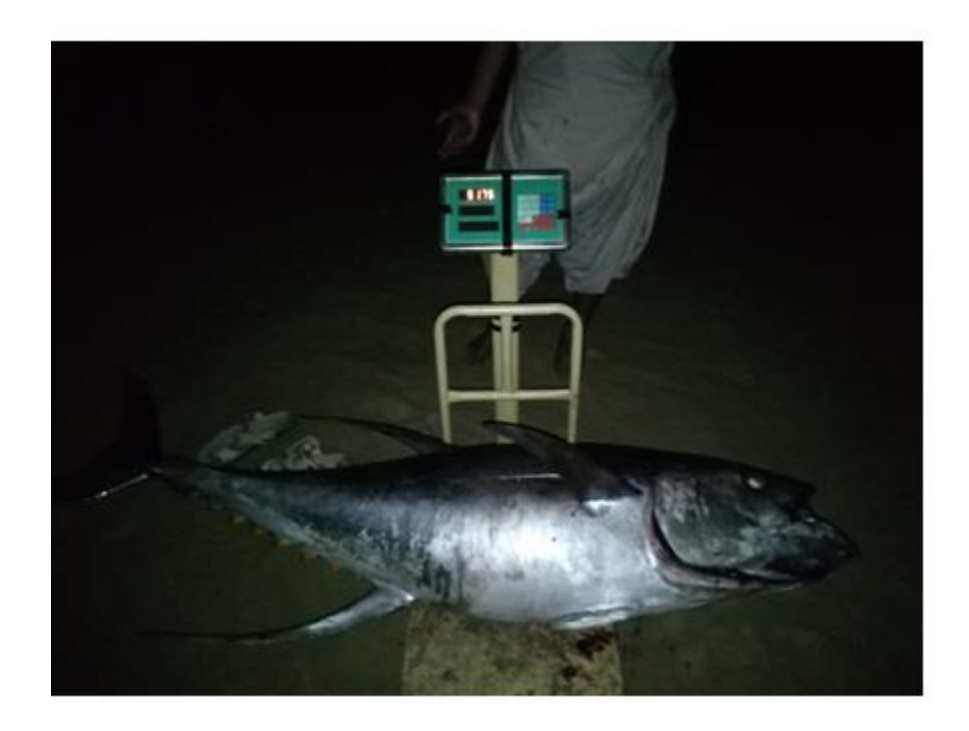
Fig. 6. Longline caught yellowfin tuna weighed before transportation to Karachi.