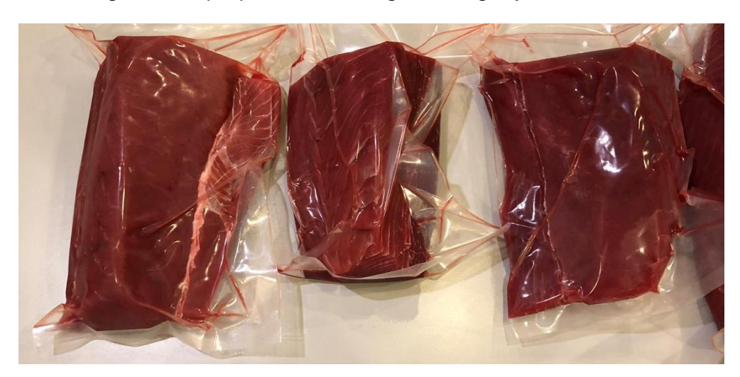
Fig. 8. Loins prepared from longline caught yellowfin tuna vacuum packed