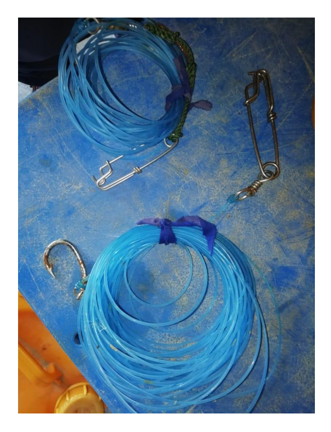
Fig. 3. Branch line stored on board for experimental longline