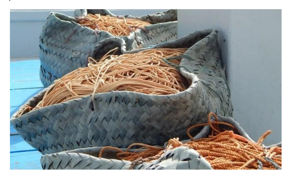
Fig. 2. Mainline stored on board for experimental longline

General arrangement of longline operation is given in Fig. 1. All the material including mainlines (Fig. 2), branch lines (Fig. 3), swivels, snap-on-clips and hooks (Fig. 3) were procured from the local market.