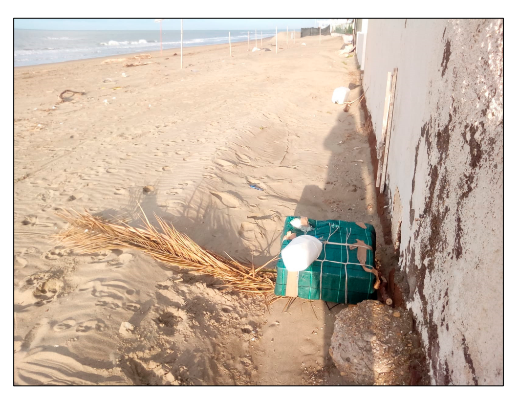
Figure 3. An example of a small artisanal FAD photographed 9 km north the location of the stranded striped dolphin. Note the green plastic sheet of the same kind found with the stranded striped dolphin.