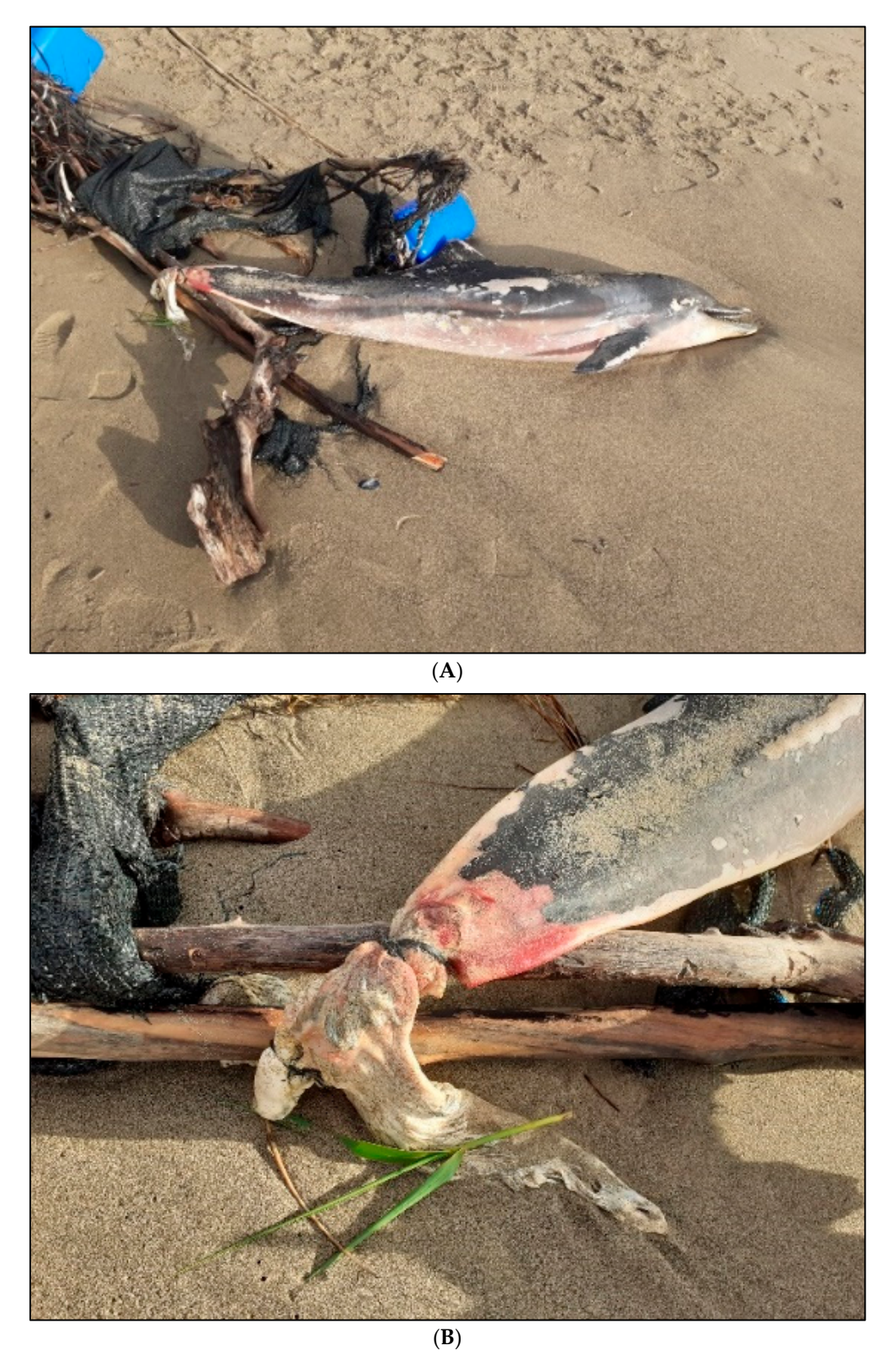
Figure 2. ( A ) beached striped dolphin ( Stenella coeruleoalba ) and remains of an illegal FAD, i.e., two scrapped 5 L plastic bottles with no vessel registration numbers, long nylon ropes, a teared dark-green plastic sheet, and the remainder of a bush branch; ( B ) detail on the peduncle (large hematomas) and tail (necrotic tissue) of the striped dolphin with the FAD's parts.