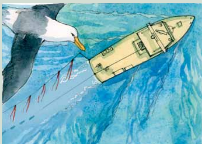
Figure 1. From the air, blue-dyed squid merge with the surrounding water.

The dyeing process requires bait to be fully thawed before they can take up sufficient dye. Food colouring, such as Virginia Dare FD C Blue No. 1 or E133, is commonly used. In Brazil, a company that specialises in food colouring, Mix Industria, has developed a dye to specifically to colour fishing bait. Depending on the concentration of the dye and the desired colour, bait is soaked from 20 minutes to four hours. Comparison with a colour card determines when the desired colour has been achieved. Bait is often refrozen after dyeing and used in a semi-frozen state to improve bait retention on hooks.