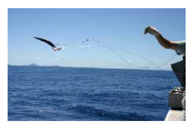
Figure 3 (a) Hook Pods fleeted in a setting bin ready for line setting; (b) Hook Pods hanging from the swivel; (c) Baited hook with hook pod in situ being cast astern during line setting