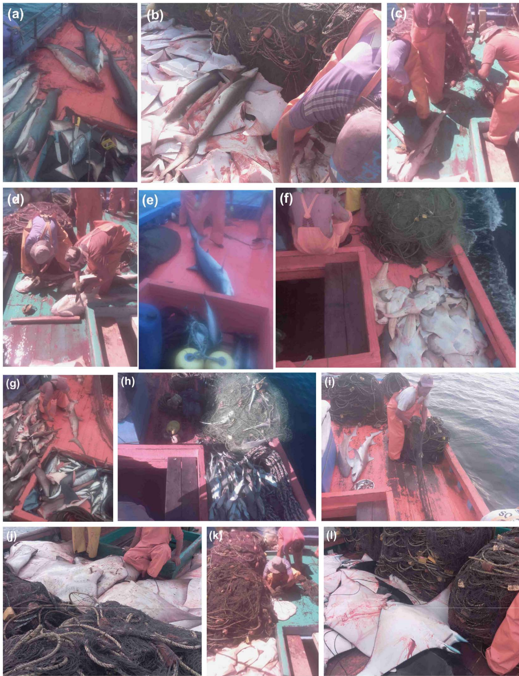
Fig. 2. The target species of the San José and Bayóvar fishery includes several shark and ray species: (a) thresher sharks ( Alopias spp.), (b) bronze whalers ( Carcharhinus brachyurus ), (c) school sharks ( Galeorhinus galeus ), (d) broadnose sevengill sharks ( Notorhynchus cepedianus ), (e) Blue sharks ( Prionace glauca ) (f) Pacific angel sharks ( Squatina californica ), (g) hammerhead sharks ( Sphyrna spp.), (h) smoothhound sharks ( Mustelus spp.), (i) spotted houndsharks ( Triakis maculata ), (j) eagle rays ( Myliobatis spp.), (k) pelagic stingrays ( Pteroplatytrygon violacea ) and (l) spintail devil rays ( Mobula japonica ). Images captured using cameras developed by Shellcatch Inc. installed on the fishing vessels involved in our study.

were re-applied after removal of a highly influential anomaly and a new split point was identified at 15.73 (1.23 SE, n = 361 ). For small catches (observer quantity \leq 15 ; n = 279 ), observer quantity and taxon were retained in our MAM (see Supplementary Tables 2b & 3b):