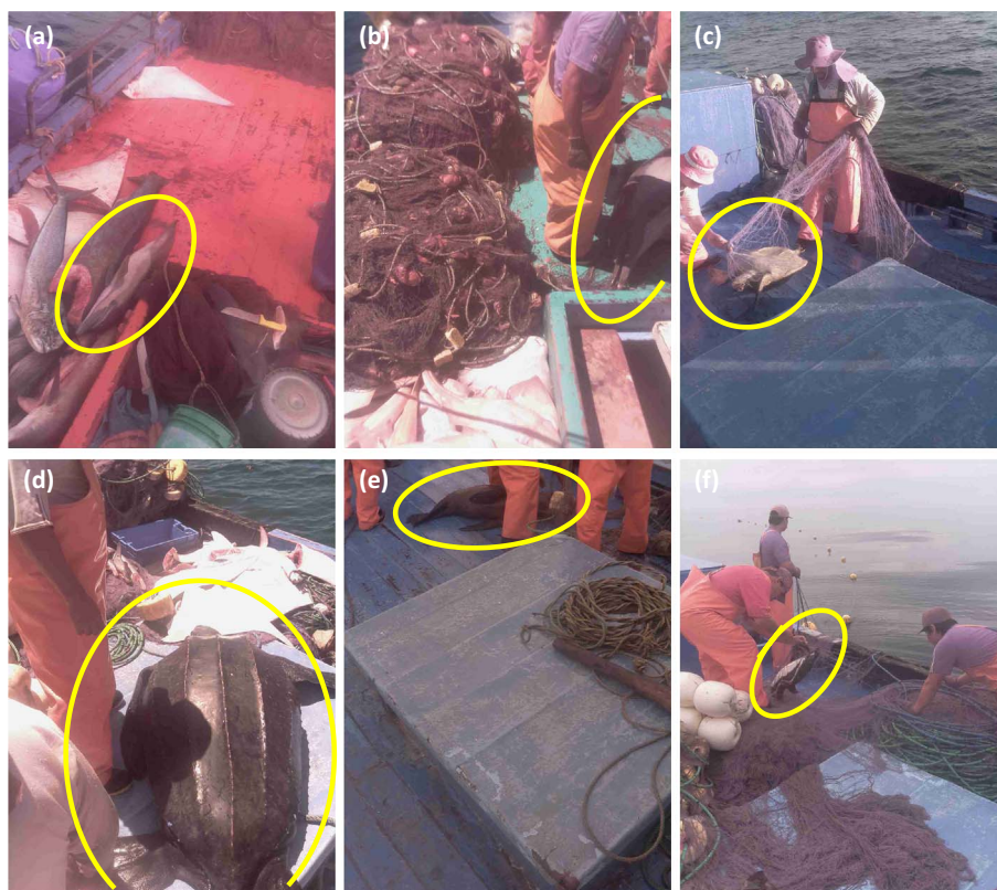
Fig. 4. Several species are also caught incidentally in the fishery: (a) common dolphins ( Delphinus spp.), (b) dusky dolphin ( Lagenorhynchus obscurus ), (c) olive ridley turtle ( Lepidochelys olivacea ), (d) leatherback turtle ( Dermochelys coriacea ), (e) South American sea lion ( Otaria flavescens ) and (f) Humboldt penguin ( Spheniscus humboldti ). Images captured using cameras developed by Shellcatch Inc. installed on the fishing vessels involved in our study.

is expected overall performance will improve through modifications to the camera's specifications, as found in previous studies (Ames et al., 2007).