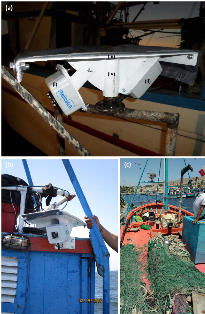
Fig. 1. The camera system developed by Shellcatch Inc. used in our study to monitor catch includes (i) a camera and GPS logger, (ii) a battery pack, (iii) a solar panel to charge the battery, and (iv) a metal frame to mount the camera to the boat. The position where the camera was installed depended on the vessel's configuration. Attachment locations included (a) guard rail (vessel 2); (b) cabin (vessel 3); (c) mast A-frame (vessel 5).

sometimes yield biased information, resulting from deployment effects (Benoît and Allard, 2009), observer effects (Benoît and Allard, 2009; Faunce and Barbeau, 2011) and low fleet coverage (McCluskey and Lewison, 2008). Monitoring small-scale fisheries through observers poses a major challenge due to the large number of vessels, limited number of trained personnel, low enforcement and vigilance, and difficult working conditions, given the small size of vessels (Salas et al., 2007).