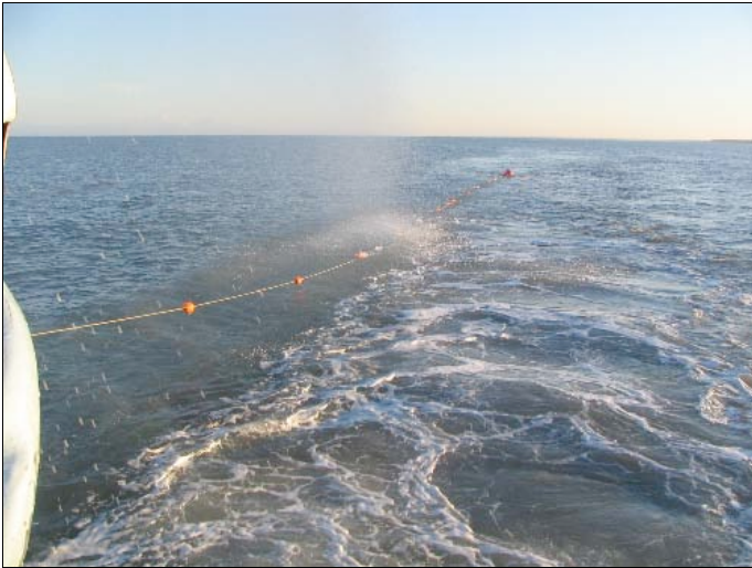
Spray hitting line marked at 5-m intervals - F/V Sonship II

with still photographs. A slight breeze was observed to blow the spray off the setting gear. In calm conditions, the total length of the area covered by spray fore of the vessel ranged from 1-15 m and the spray fell to the water 30 m fore of the vessel, which was moving in reverse.