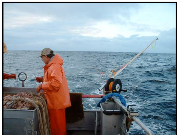
Testing a custom-made davit and experimental streamer line design - F/V Dues Payer II

Recommendations as a result of this project are: 1) consideration be given to testing seabird deterrence of lighter-weight streamer lines, 2) if found effective, lighter-weight streamer lines be constructed and distributed for free to small boat operators, 3) research on the use of integrated weight groundline on smaller vessels be continued, particularly on the 40 - 50 ft LOA vessel class, and 4) outreach efforts be undertaken to inform smaller vessel owner/operators about buoy line covering, davit designs and associated costs.