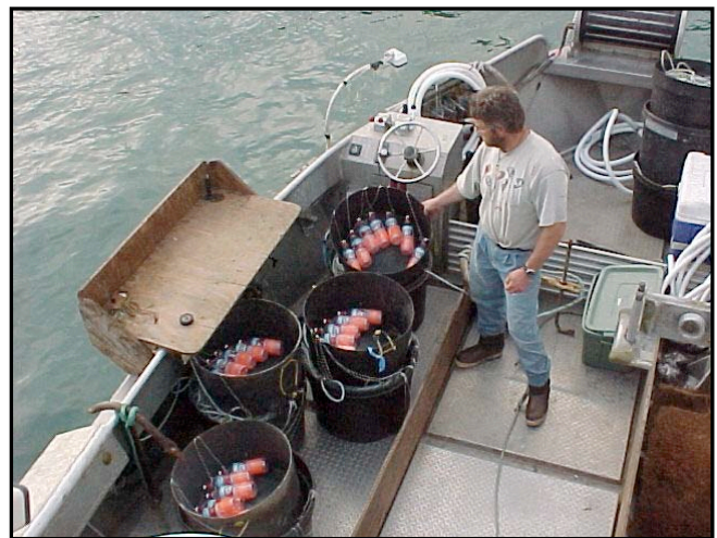
Groundline sink rates were measured using flagged bottles attached to 2-m gangions - F/V Cape Fear

for 32 ft LOA vessels setting snap gear, which requires that the streamer remain aloft for 65.6 ft (20 m) behind the vessel and within 6.6 ft (2 m) horizontally of the point where the main groundline enters the water. Streamer line performance standards for this vessel type can be met using this device and a lightweight streamer line.