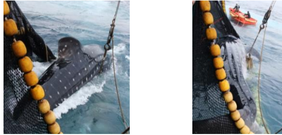
Figure 1. Best handling practice to release whale sharks from encircling purse seine nets (Poisson et al., 2014), observed in the Atlantic Ocean.

the shark's head was free to move over the slack float line. This method was used irrespective of the orientation of the shark in the sack in the horizontal plane (head towards the bow or the stern), however, the maneuver was faster when the head of the animal pointed towards the bow of the vessel (a few minutes long as opposed to 20–30 minutes). When the shark was very large ( e.g. 12 meters for shark n°2, see Table 1 ), the crew had problems sacking up the catch, thus the shark was first released before any tuna were brailed, by cutting a few meters of nets in front of the shark's head, allowing it to swim out.