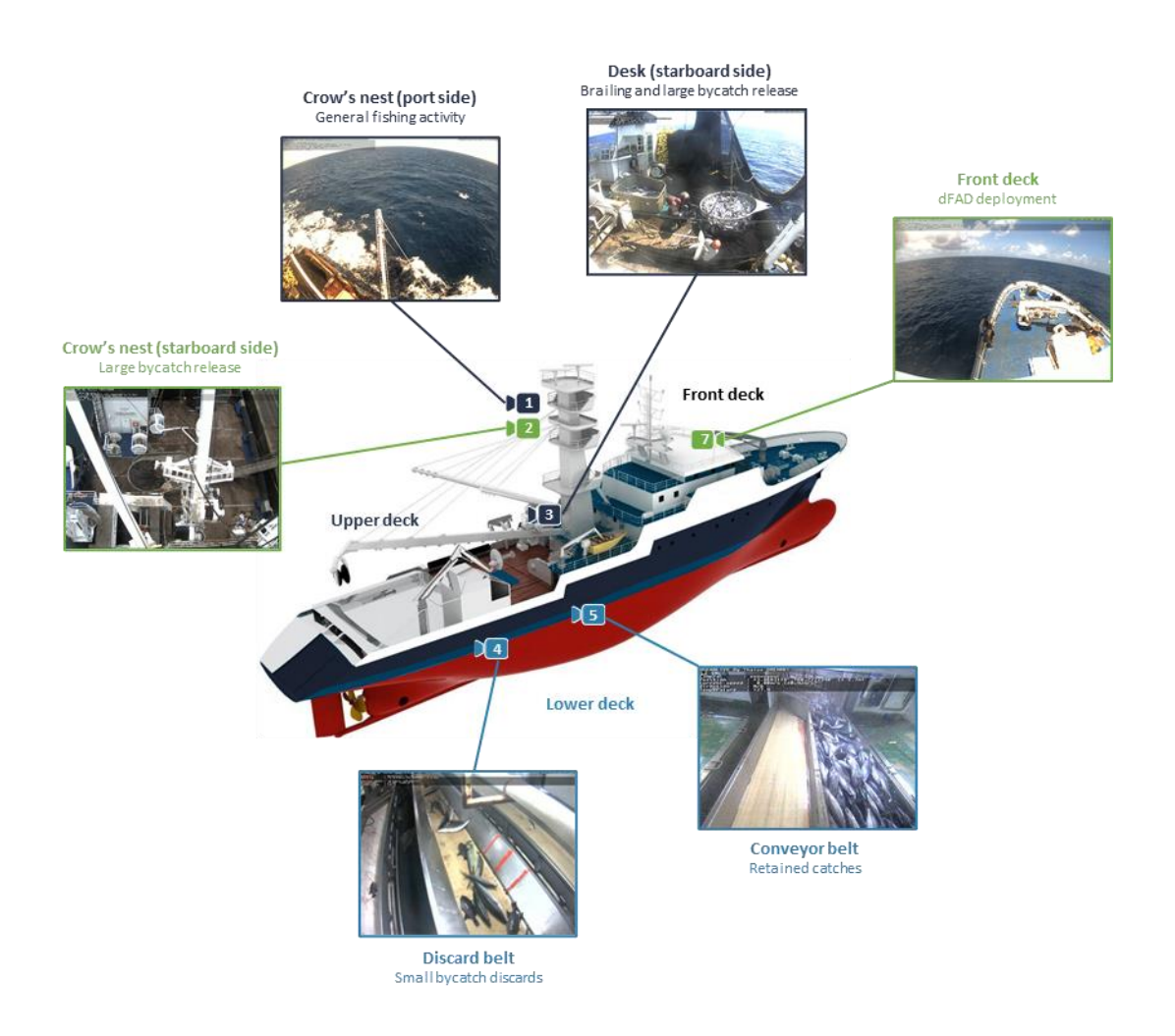
Figure 3 : EMS configuration 2.0, currently in deployment. Additional cameras (starboard side crow's nest and front deck) are highlighted in green.

On the upper deck, where setting, pursing, brailing operations and sorting of large bycatch must all be covered by electronic observers, an improved configuration is currently being deployed with (i) a port side crow's nest camera to monitor the general fishing activity including setting, pursing, and brailing (ii) a desk camera to record brailing operations and (iii) a starboard side crow's nest camera, currently in deployment, to solve known issues of blind spots of the desk camera. In the lower deck, two or three cameras record sorting operations along the conveyor and discard belts. Finally, a front deck camera is currently in deployment to record activities of drifting Fish Aggregating Device (dFAD) deployment at any time (day or night).