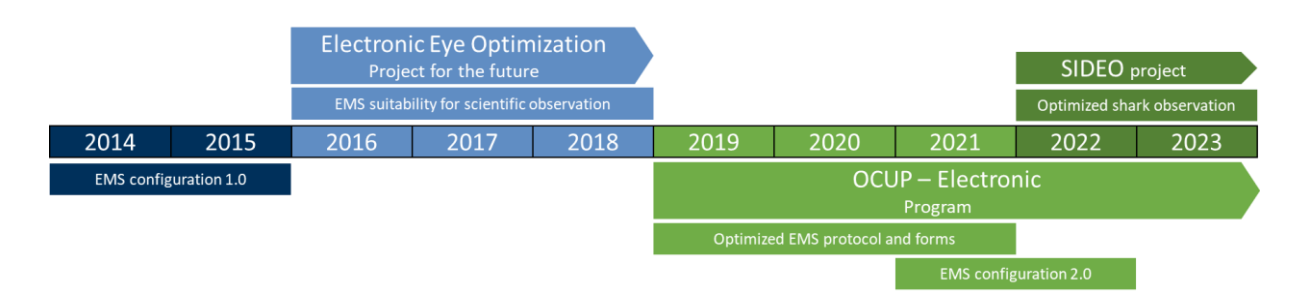
Figure 2: progress made since 2014 on EMS configuration and protocols for the scientific observation of discards of EMS-equipped French and Italian tropical tuna purse seiners of the Indian Ocean.

Since 2014, various pilot projects have allowed gradually improving EM configuration to solve issues of insufficient image definition, overexposure, water projections or blind spots when collecting scientific information on discards with EM records (Briand et al. , 2017, 2021). In complement, these projects have contributed to the development of improved solutions for the storage and the analysis of EM records (see sections 2.3 and 2.4).