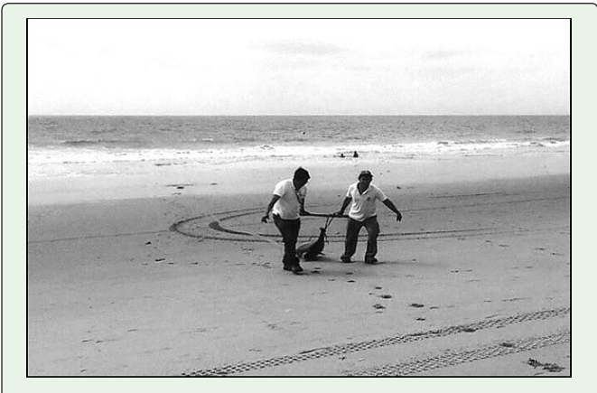
Figure 2: Two dolphins identified as belonging to the species common ( Delphinus delphis ) and bottlenose ( Tursiops truncatus ) dolphins were found dead on the beaches of San Jose de Las Nuñez and San Pablo, Santa Elena Peninsula, on August 15, 2017. The common dolphins were found without pectoral fins, while the bottlenose dolphin was missing its caudal fin or tail (see photo). The photo was originally published by the newspaper Diario EL COMERCIO on 18 August 2017 at the following link [12].

3. As a possible case of a predatory event, the attack by predators such as sharks or killer whales ( Orcinus orca ), which can be found in Ecuador's marine waters, might also be considered. For instance, killer whales attacks on humpback whales have been recorded along coastal waters of Ecuador [19-21]. For instance, a sighting of a killer whale was reported in August 2017 in Santa Elena Puntilla's waters ( P. Jimenez , pers comm., 2017). However, in this case signs of bites