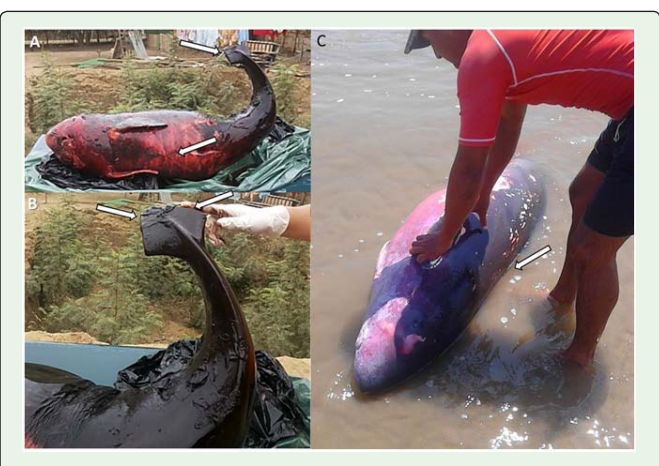
Figure 3: Specimens of dwarf sperm whales ( Kogia sima ) showing mutilation of fins. A-B) dwarf sperm whale exhibiting lack of caudal fin, which was systematically cut in two portions and removed (white arrows) and marks of entanglements by gillnets on the body (white arrow); this individual was found in the Puerto Lopez (Manabí Province) in July 2014; and, C) juvenile male of dwarf sperm whale missing the dorsal fin found in Crucita (Manabí Province) in August 2015.

and wounds inflicted by a predator were not found in any of the dead specimens.