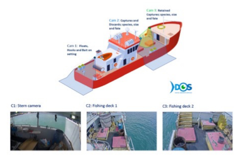
Figure 2 - 3-camera EM equipment installed on a longline covering main areas of fishing and fish handling operations. View of the 3 cameras: (left panel) Stern camera - setting longline providing information on hooks, floats, mitigation techniques and bait; (middle panel) Fishing deck 1 - hauling information, captures and discards, species ID, size and fate; and (right panel) Fishing deck 2 - fate of the species, size, species ID.

The vessel should prove that the EM system has been customized to the vessel to collect the required data on fishing activities, as described above (and summarized in Tables 2 and 3).