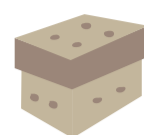
Box / Bin